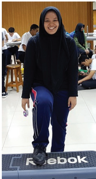
Figure 1 Harvard Step Test

and the results showed that HR before exercise was normal in both gender; however, the HR before and after exercise were higher in females ( p=0.03 ) and ( p<0.001 ). The La^- 1 concentration (before exercise) in males was higher than the normal value and also higher than that of females ( p=0.001 ). This result is in contrast with an earlier study that found the La^- in females is higher. A previous study has revealed that a body fat level of more than 15% is linked to a higher La^- . 11 Unfortunately, this study did not assess the body composition that might be able to explain why the male La^- in this study was higher. The concentration of La^- 2 after exercise increased in both gender and was higher significantly in females ( p<0.001 ). This finding supports the theory stating that during short and high intensity PA, the skeletal muscle produces La^- more rapidly that is followed by increasing concentration in the circulation. 7,8 Previous studies have proven that increased blood lactic acid after exercise is a prognosis determinant in subjects with dyslipidemia, congestive heart disease, and chronic obstructive pulmonary disease. 3,11